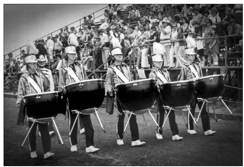
1973: Toronto Optimists tymps

"Don't count the Optimists out until Nationals retreat" was an