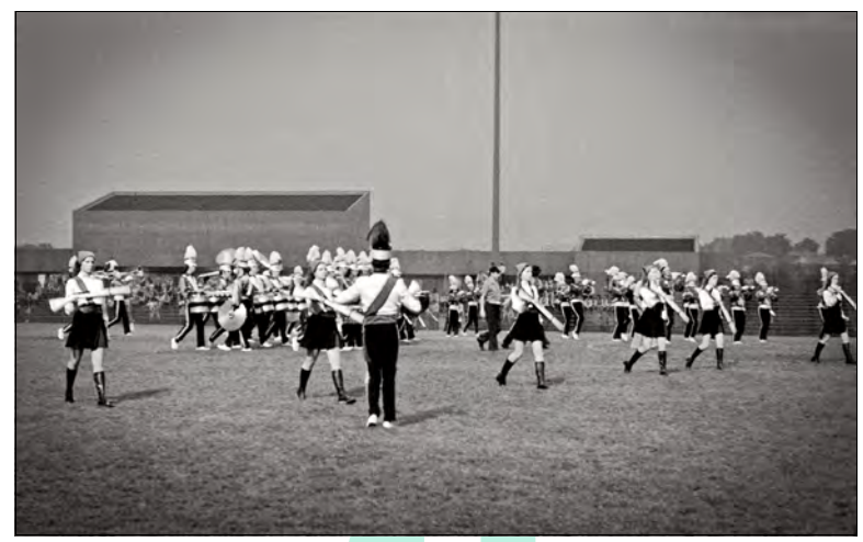
1973: Toronto Optimists

Worse was to come. After the rehearsal following the Windsor show, the Director and Music Director handed in resignations. The Corps seemed ready to be folded. After another rehearsal, and an all evening meeting, six members were expelled. Another twelve were cited for less harsh disciplinary measures. The continent-wide plague of drug use had finally caught up with the Optimists. Nothing in the entire history of the Corps had ever caused such an upheaval. Drugs