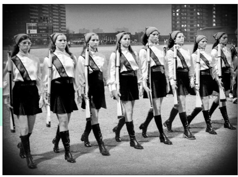
1973: Toronto Optimists Rifle Line

One factor that helped was holding meetings at restaurants, or similar places, where one could partake heartily of the fare. Business, though, was never forgotten, as the meetings often ended with the ringing reminder of "get one's dues in – Now!"