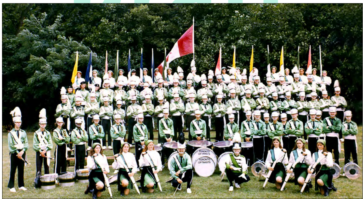
1973: Toronto Optimists Full Corps photo (US Open)

Reflecting this, at Marion, they put on one of the worse shows of the year. Even though, they made the finals. They backed in. Someone must have been even worse. The Saturday finals saw the Corps finish their show, but all the rest were rained out. Doing it again on Sunday, they showed no great improvement. They did not stay for retreat, having to get to Windsor, Ontario, for another contest. Somebody stayed to get the results.