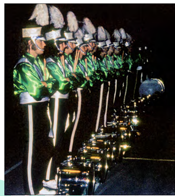
1973: Toronto Optimists drums

The Optimists had not won any of these but had improved their overall score by three points. They had defeated De La Salle by 3.9 at the last show. These scores were a reflection of last year when all had been close, or even very close, but higher overall. On it went!