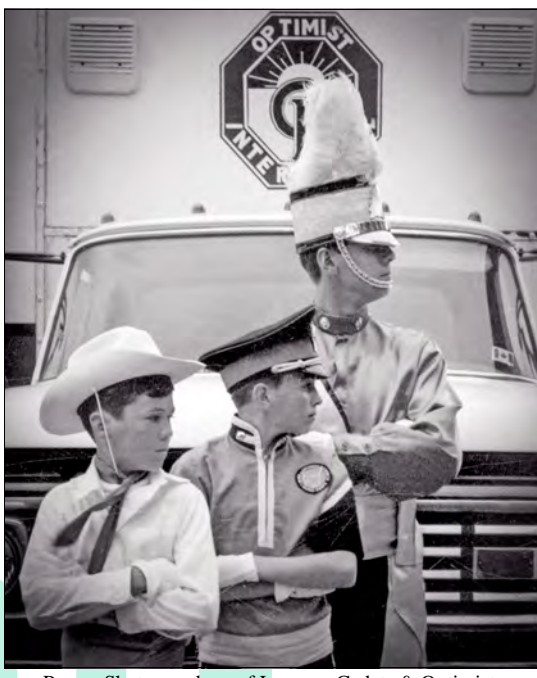
Promo Shot: members of Lancers, Cadets & Optimists

The Lancers did well in the 1973 individuals, placing four members in the finals. They had assistance from