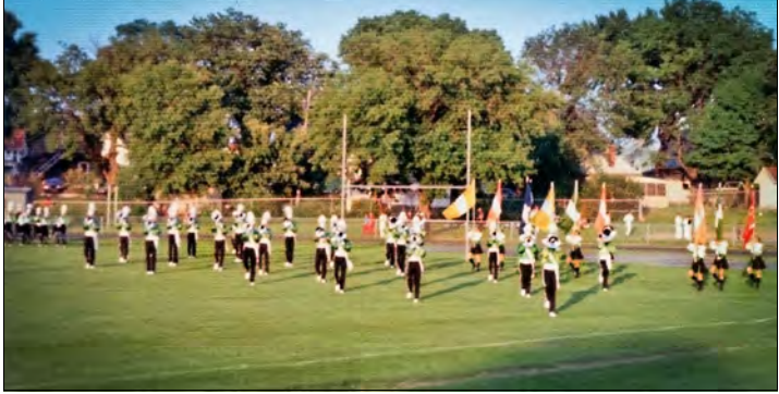
1973: Toronto Optimists

June 3rd 1st La Salle 2nd De La Salle 3rd Optimists