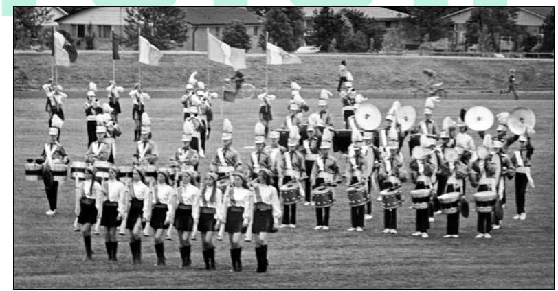
1973: Toronto Optimists

The corps went by the way of Sudbury and Sault Ste Marie, to Oshkosh, Wisconsin, getting there despite a flat tire, fuel and battery problems, navigation, etc. Positions were pre-drawn, so the business managers' meeting was about judging et al. The Optimist show was called, patented, "show-after an epic odyssey".