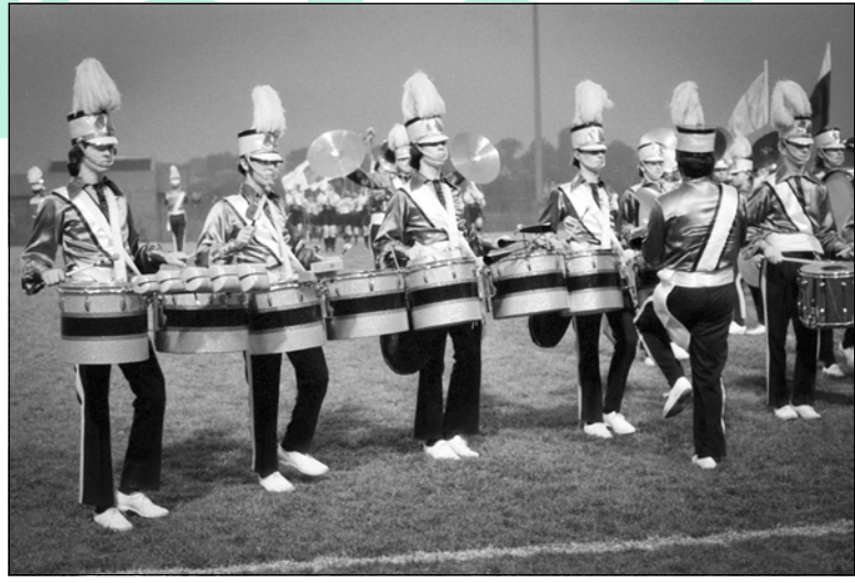
1973: Toronto Optimists Drums

After that working holiday, it was back to "Home Sweet Home". And more challenges.